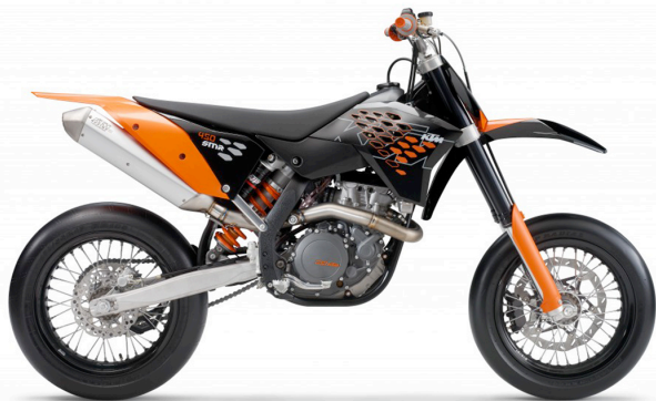
Figure 3: A KTM racing bike.

KTM is a relatively low-volume producer of racing motorcycles and also makes 300-400 four-wheeled racing cars each year. Product cycles are relatively short, and KTM doesn't have a huge volume of old designs to manage.